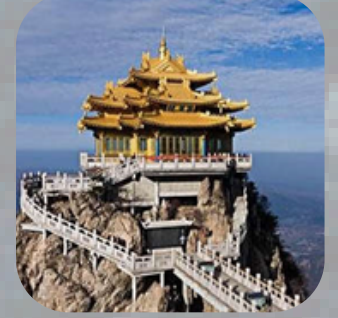
Jade Emperor Peak (Yuhuang Ding)