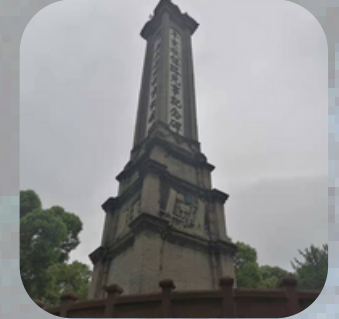
Xin Hai revolution martyrs