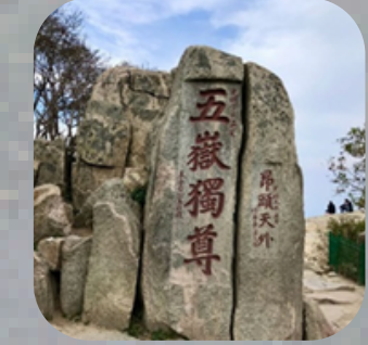
Wuyue Duzun Inscription