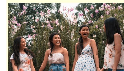
Vanda Miss Joaquim display

The close relationship between humans and natural environment.