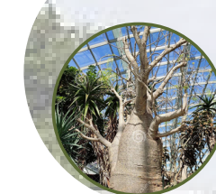
Adansoni a digitata