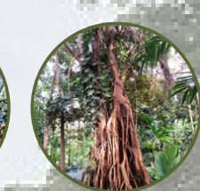
Ficus kerkhov enii