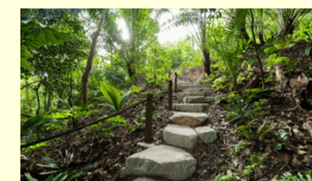
Mingxin Foundation Rambler's Ridge